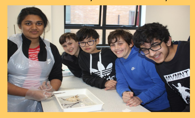
Here's to the next one!

Huge thanks to every single person involved in bringing it together, and especially to the student body for embracing the organised chaos and getting so enthusiastically involved in the day.