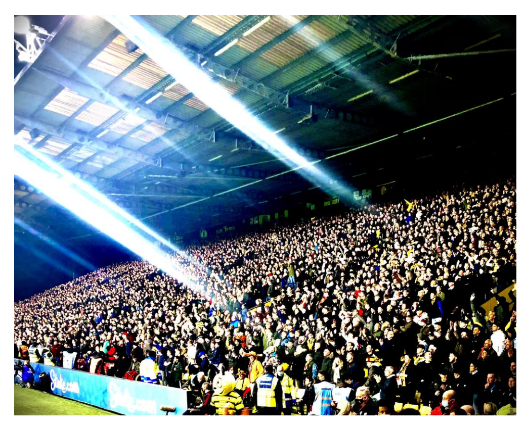
Ollie Arnold 11AKY

The Art & Photography department ran our annual photography competition and this year's theme was 'support'. The competition was open to all students across all year groups, regardless of their subject choices. They could interpret the word 'support' however they liked, as long as the image included a clear link, an interesting composition, and was aesthetically pleasing. We had four winners this year who received a portable photographic studio as a prize.