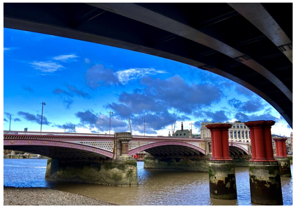
Erno Thorp 8CMO